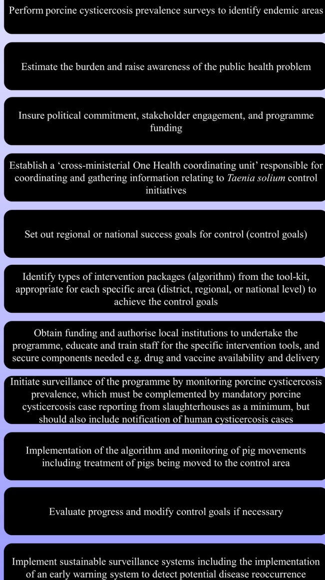
Fig. 1 Stepwise approach to sustainable Taenia solium control

phase, which must be complemented by mandatory porcine cysticercosis case reporting as a minimum, but should also include notification of human cysticercosis cases (step 8). Local institutions can now implement the algorithm, in conjunction with government support to enforce monitoring of pig movement into control areas (step 9). Monitoring pig movement might also reduce risk of introducing other porcine diseases such as African swine fever into control areas, thus, strengthening the control programme and community compliance. Measures should be taken to